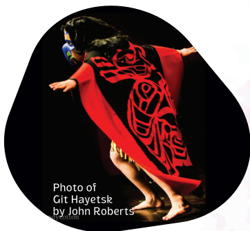
Photo of Git Hayetsk